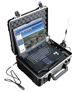
3G Mobile Laptop Reading System