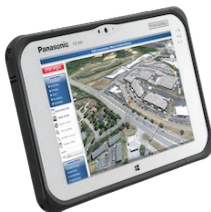
3G Mobile Tablet Reading System